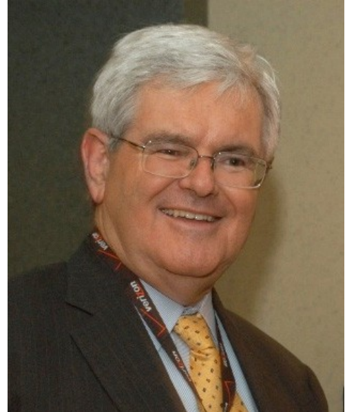
Former House Speaker Newt Gingrich points out how radical Islamists are taking advantage of America's commitment to religious freedom

ness of America that we have had such difficulty coming to grips with the challenge of radical Islamists. It is our very commitment to religious liberty that makes us uncomfortable with defining our enemies in a way that appears linked with religious belief. However, America's commitment to religious liberty has given radical Islamists a potent rhetorical weapon in their pursuit of sharia supremacy."