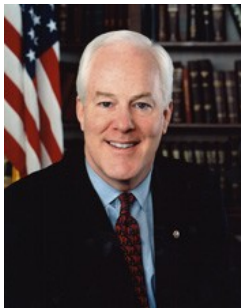
Senator John Cornyn (R-TX) is one of the many politicians to speak out against President Obama on this issue

Sen. John Cornyn (R-TX) said Obama's comments show: "the president himself seems to be disconnected from the mainstream of America."