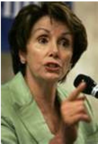
Speaker Nancy Pelosi spoke out against the majority of Americans who oppose the building of the mosque

Conservative commentators such as Hugh Hewitt, Pat Buchanan, and Charles Krauthammer have called on elected officials to give Ground Zero the kind of historic site protections that other famous American battlefields receive, such as Yorktown and Gettysburg.