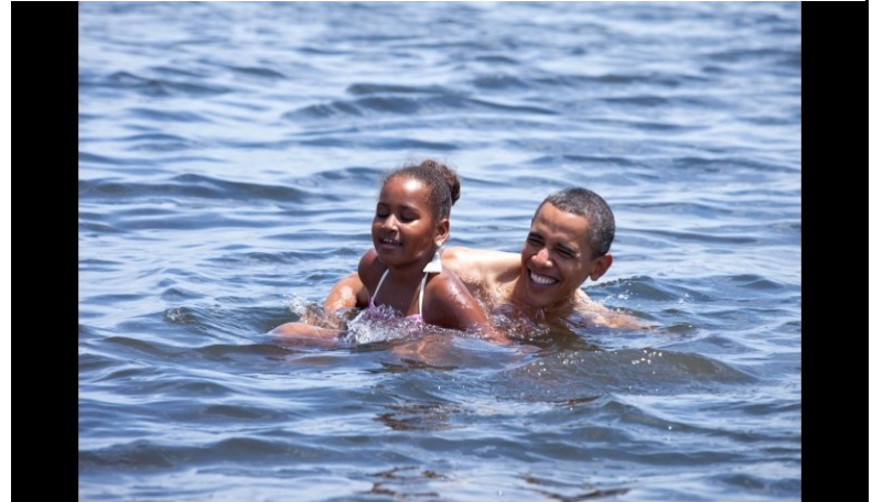
In a publicity stunt, President Obama swims with daughter Sasha in the Gulf waters off the coast of Panama City, Florida.

offshore oil exploration. Prior to the Gulf spill the agency was best known for its employees having carried on illicit and inappropriate relationships and activities with the industry insiders they regulated.